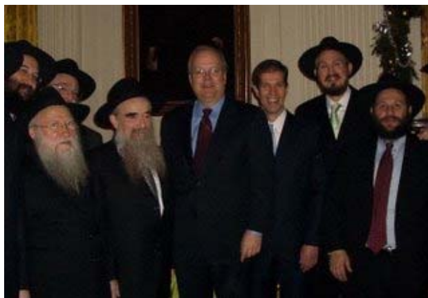
Deputy White House Chief of Staff, Karl Rove